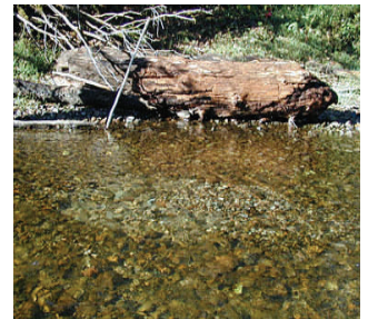
The light gray colored gravel on the above stream bed is a trout “redd” which serves as a spawning bed for trout. Maintaining optimum stream temperatures is key to allowing Waterloo Creeks Brown trout population reproduce naturally.

tures. Reducing sediment loads going into the stream is one vital way to help maintain adequate temperatures in the streams. Heavy sedimentation can change the clarity of the water, allowing more absorption of solar radiation, which raises the mean temperature of the water.