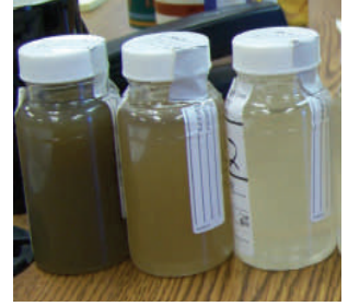
The above image is water samples collected earlier this year from Waterloo and Bee Creek. The samples are tested for E.coli. Evidence of suspended sediments is evident in some of the samples

within the stream. All values are important to show how interactions and conditions affect the water quality in the watershed streams. Since April of 2010 water sampling has been conducted by the Allamakee SWCD at 8 selected points. The locations are along Bee, Duck, and Waterloo Creek. Valuable data has been collected since the spring and will be through the late fall. All water sampling data will be available in Waterloo Creek Watershed Plan, which will be released in December.