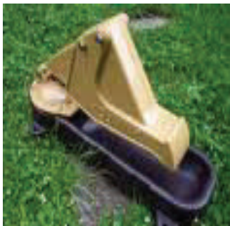
The above image is animal operated water pump. Typical pumps can be mounted on fence line structures.

Balancing the needs to protect and conserve natural resources while keeping agricultural operations economically viable can be a formidable task. While some practices may not be realistic for a number a different reasons. Many low cost and low input activities can help aid in conservation of soil and water quality. Fencing off streams from livestock not only reduces sedimentation and bacterial counts in the water, but improves overall herd health. Wet, muddy conditions increase the risk of mastitis, foot problems and other illnesses in livestock. Fencing streams off from animals will